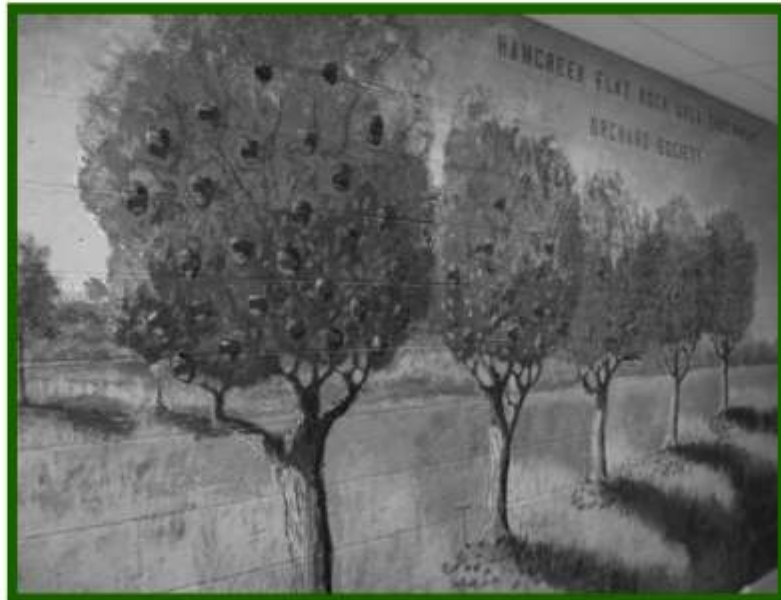
Located in the entrance hallway of the Community Center of Hope, the Orchard Society display honors donors who have contributed lifetime gifts of $1,000 and over. A special thanks to the Art Guild of Hope for the time spent designing and painting the mural and to the community center for providing the space.